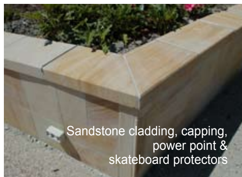
Sandstone cladding, capping, power point & skateboard protectors