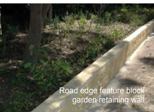
Road edge feature block garden retaining wall