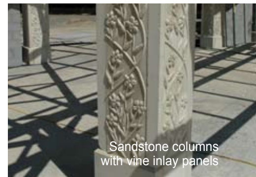
Sandstone columns with vine inlay panels