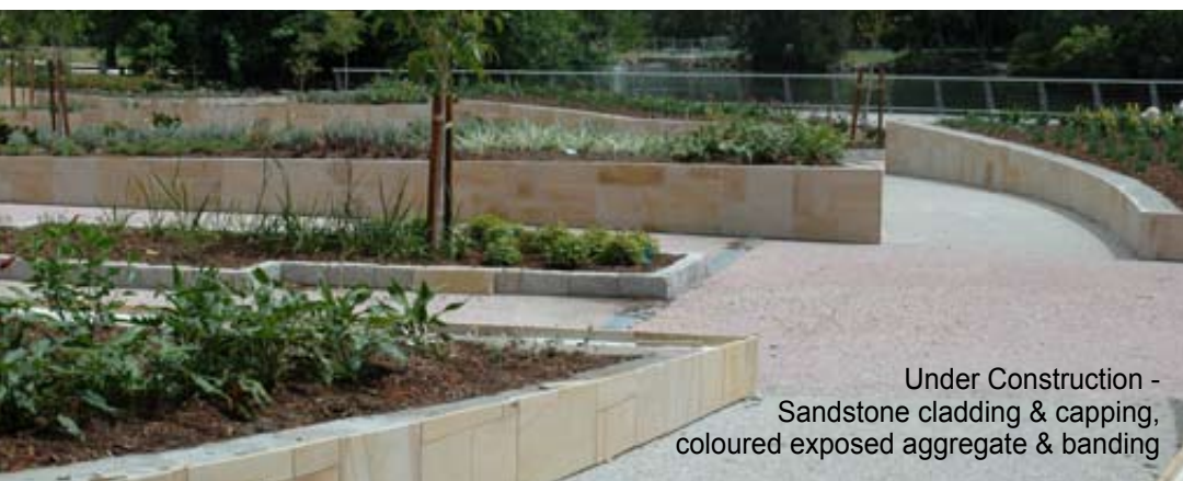
Under Construction - Sandstone cladding & capping, coloured exposed aggregate & banding

Scapes Shapes Landscaping Pty Ltd 21 Jay Gee Court, Nerang, Qld 4211. A.B.N. 32 073 042 458 QBSA Act Lic. 76558 p. 07 5596 0166 f. 07 5596 0263 e. info@scapesshapes.com.au