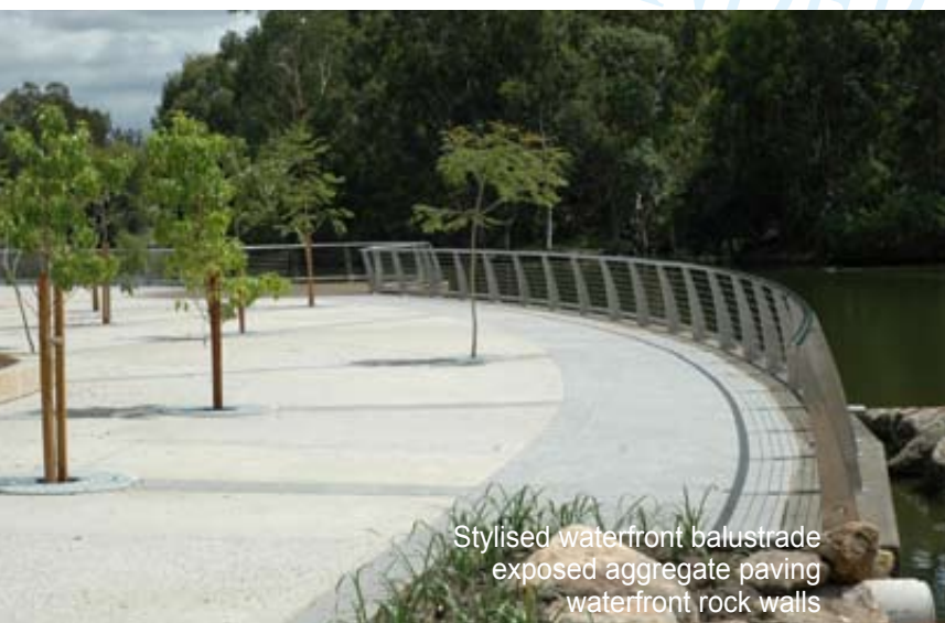
Stylised waterfront balustrade exposed aggregate paving waterfront rock walls