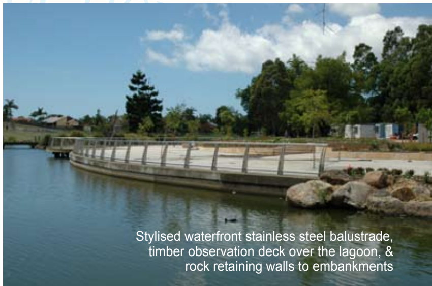
Stylised waterfront stainless steel balustrade, timber observation deck over the lagoon, & rock retaining walls to embankments