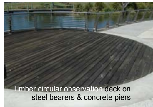
Timber circular observation deck on steel bearers & concrete piers