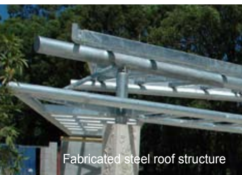
Fabricated steel roof structure